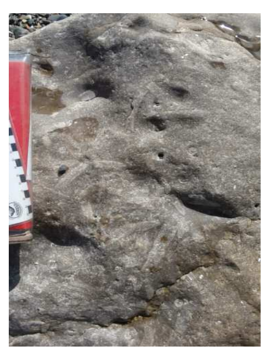
Fig. 1 crinoids and corals.

Tollhouse Mudstones are thinly bedded, crumbly, grey marls that contain very little clay. Sedimentation rates were low and deposition was in a low energy, near shore environment there are also burrows and odd shell fragments. There were several shallowing and deepening episodes as shown by the interbedded limestones.