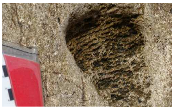
Fig. 3 Zebra dolomites.

The Great Orme Limestone developed during a period when the ice caps were waxing and waning; ten cycles have been identified. When sea level was low a soil or proto-soil horizon