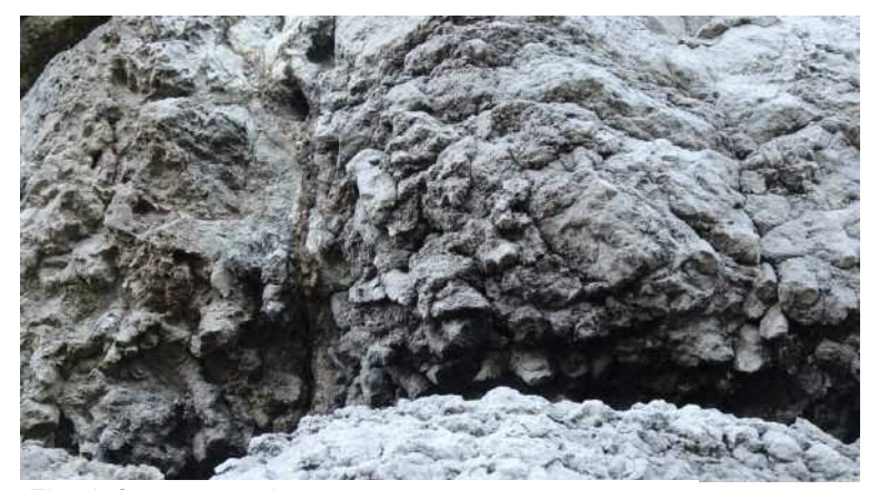
Fig. 6 Crustacean burrows.

tolerant brachiopods and sponges to flourish. The sponge spicules are opaline (hydrated silica) that dissolves and then moves through the sediment to fill the burrows (Fig. 7); in the process it changes to chert, which prevents later compression of the beds.