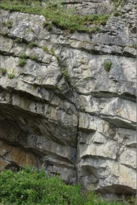
Fig. 5 syn-sedimentry faulting.

Farther along the road we came to a break in the shelf deposit where wave energy was relatively high as could be seen in the thick beds that have large foresets dipping to the North. Here there are some massive burrows, 50 mm or more in diameter, (Fig. 6) that are associated with the muddy horizons that were probably made by some type of crustaceans (possibly shrimps). Some of the beds are finely laminated and are of clean fine grains and no burrows so high energy deposition. The fractures here are post compaction because they cross the stylolites.