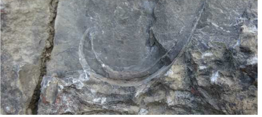
Fig. 8 Top none spiny Gigantoproductid in life position and below a spiny species; one of the spines can just be seen to the left of my finger there are also several stumps where spines would have been attached.

first episode of burial; it was also the end of our trip.