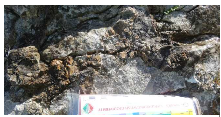
Fig. 7 Chert infilling burrows.

The Bishops Quarry Limestone is immediately above the Craig Croft Sandstone and the first unit of the Brigantian. The environment was beginning to change to deeper water with an influx of clay, which reduced light levels allowing the more