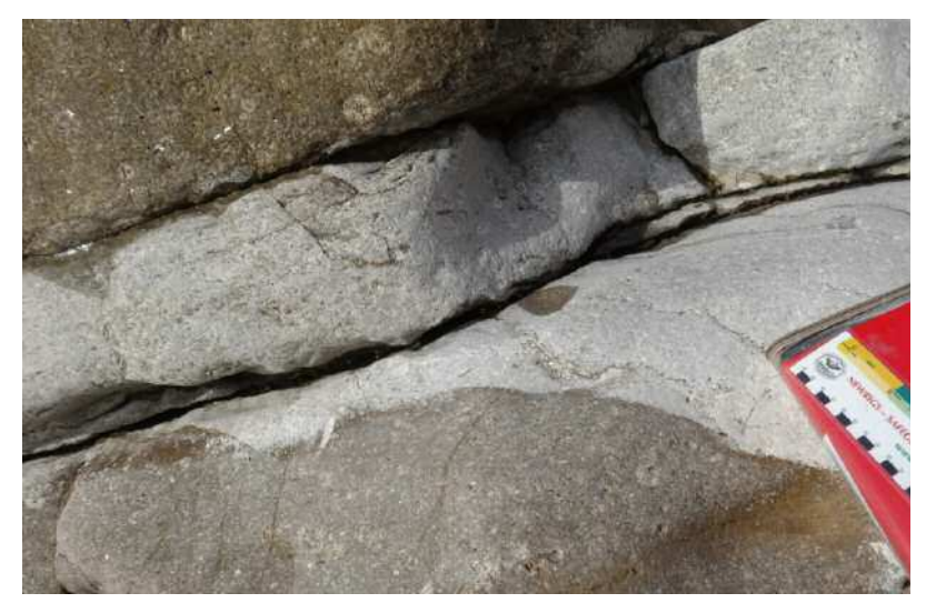
Fig. 2 random dolomitisation of the limestone.

developed on the exposed, reworked and karstic limestone surface of each cycle. The proto-soil horizons are orange and the more developed soils tend to be pink to grey (Fig. 4), some are lithified; burrows can be seen in the overlaying limestone. The soil horizons can be very small pockets (tens of mm thick and half a meter wide) or quite extensive. Above the soil horizons, but not related to them, a fault plain surface could be seen with large chunks of fault breccia to the right where the fault moved against the stable bedding. There are also some very good examples of syn-sedimentry faulting as can be seen in Fig. 5.